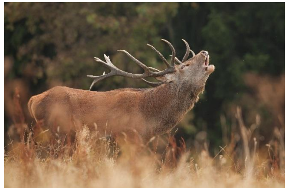
From top: Common Crossbill, Goldeneye & Red Deer